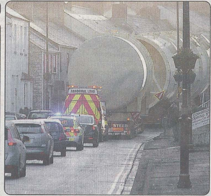
ABOVE: It's a really tight squeeze as the lorries with their giant load make their way through Cowbridge.